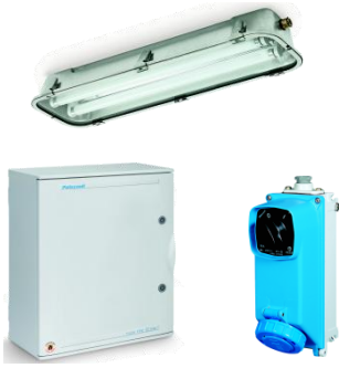
TAIS TRE, ALUPRES and RINO Series

The Alifana Bassa Railway is based on the renovation, with modern infrastructures (new track, normal gauge, direct current electrical supply at 1500 V) of the old railway Alifana Napoli Piazza Carlo III. Line 1 (or 'collinare') of the Naples Subway was opened in 1993 and constitutes a most important and modern infrastructure for public transport in Naples.