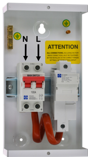
TOP ENTRY MAINS