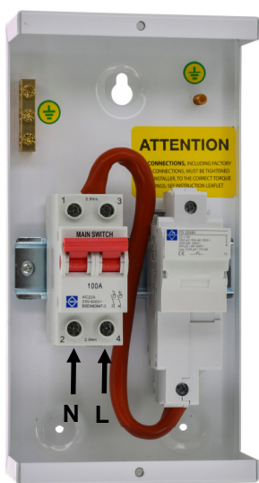
BOTTOM ENTRY MAINS